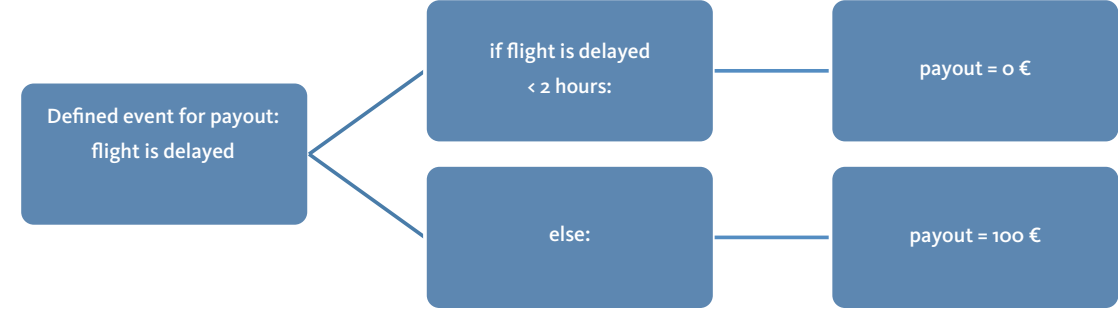
Figure 2. Simplified smart contract coding example